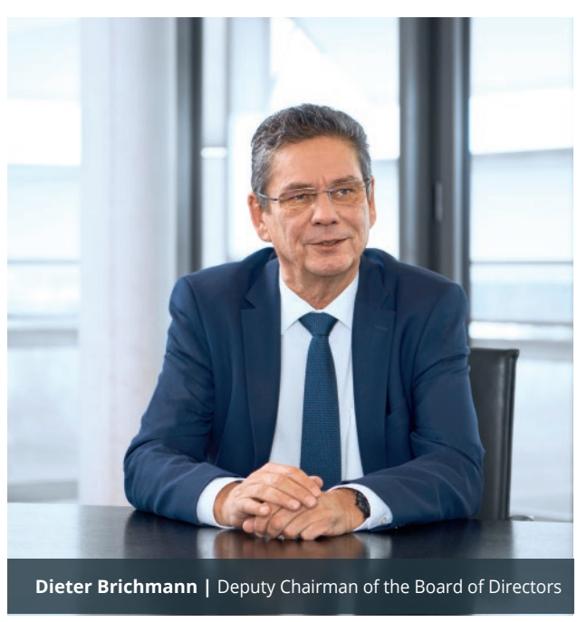
Responsibility: Finance, Human Resources, Credit, Operations